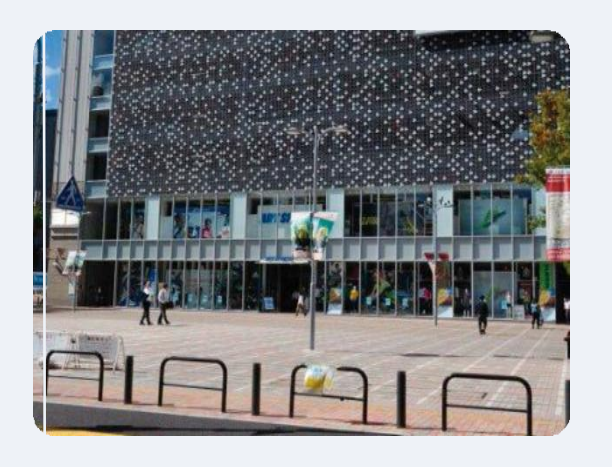
South Exit of Okachimachi Station (Panda Square)