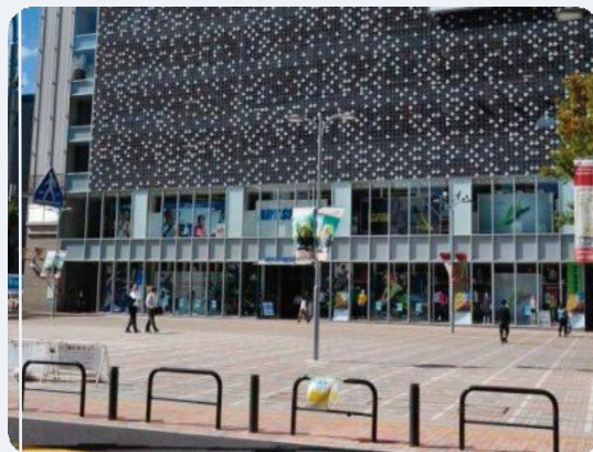
South Exit of Okachimachi Station (Panda Square)