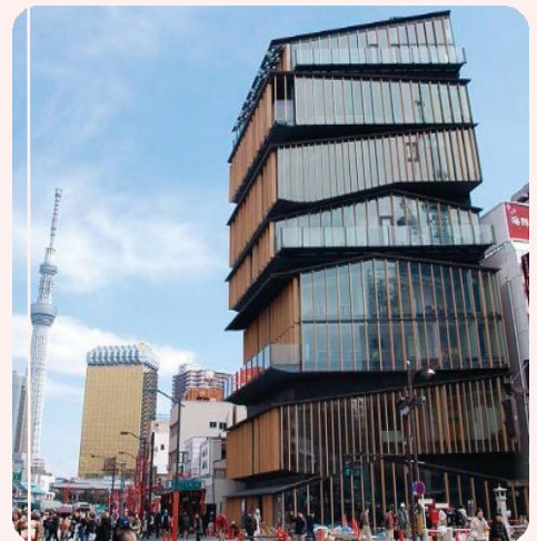
Asakura Cultural center