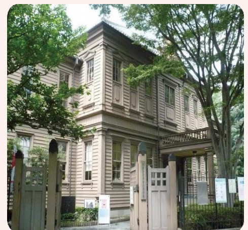
Former Tokyo Music school hall