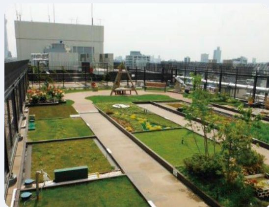
The model of roof greening "Resting"