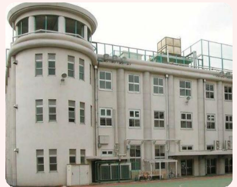
Taito Designers' Village