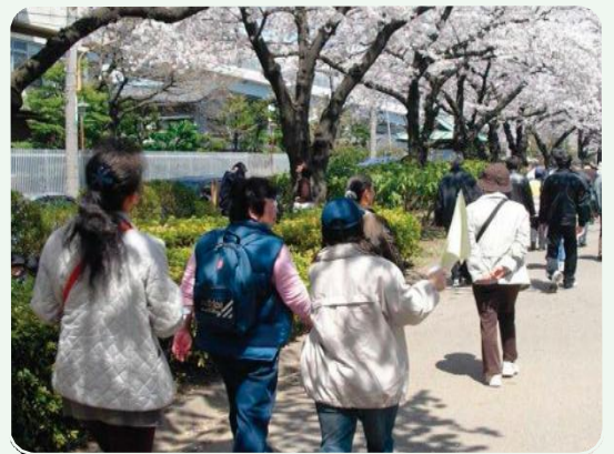
Walking activities by health promotion committee