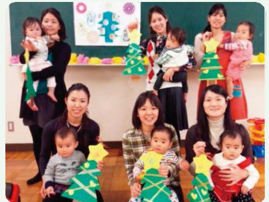
Group activities in the Child support center