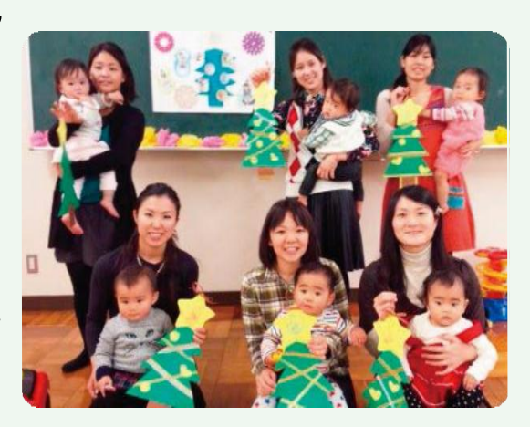
Group activities in the Child support center