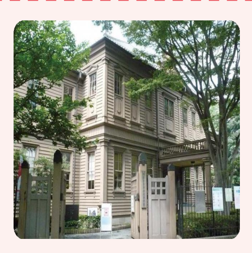
Former Tokyo Music school hall