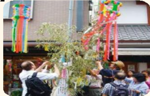
Japanese class (cultural lesson)