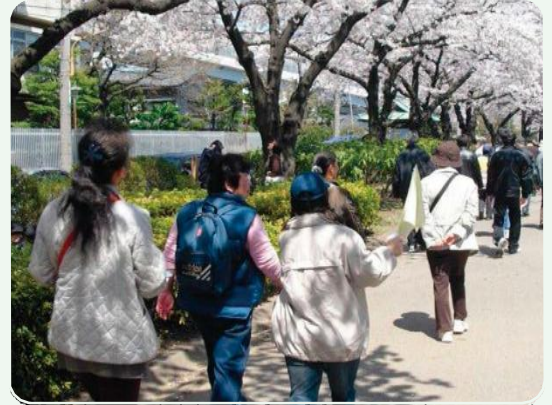
Walking activities by health promotion committee