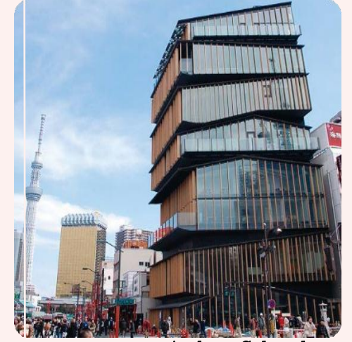
Asakura Cultural center